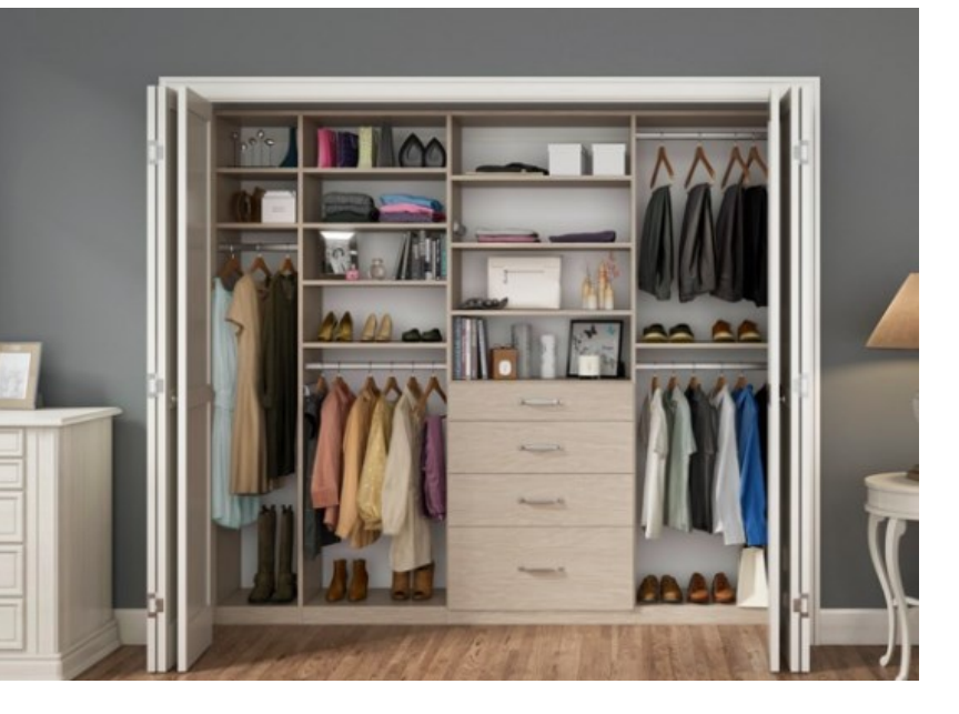
When you are done, you should get the feeling of tranquility and comfort. If you do, then the potential buyers will too.

Keeping the furniture minimal such as a bed, dresser and a couple of small items will make the room feel larger and spacious, even if it's a small extra bedroom.